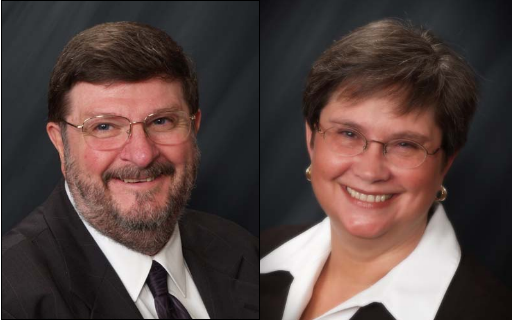
We enjoyed our time with you in Roanoke!

Participants meet the requirements for Phase 1 of 3 that result in RGB Certification . Contact us for more information of visit us online.